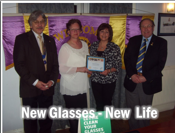
New Glasses - New Life

Guests from Specsavers Opticians were present at the March Warminster Lions Club Dinner Meeting to find out what happens to unwanted used spectacles that are passed on to the Lions Club for recycling.