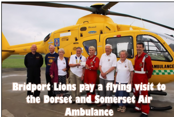
Bridport Lions pay a flying visit to the Dorset and Somerset Air Ambulance

It was both a privilege and a pleasure for members of the Bridport Club to attend Henstridge airfield on 2 July. They were there to present a cheque for £500 raised from proceeds of their Blues Extravaganza back in March, to the regional air ambulance.