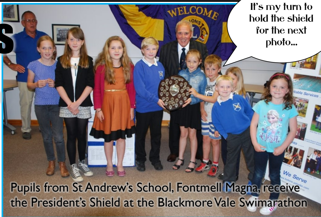
Pupils from St Andrew's School, Fontmell Magna, receive the President's Shield at the Blackmore Vale Swimarathon

Please send all articles and pictures for publication in the