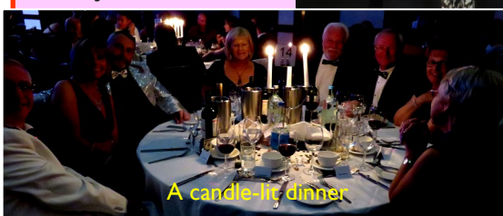
A candle-lit dinner