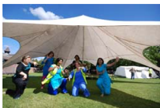
Youth club youngsters putting on a professional *Bollywood* dance show