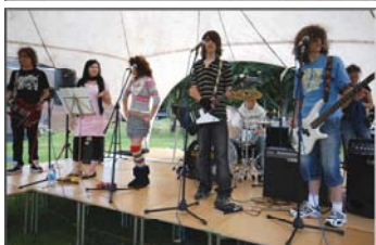
Picture shows the youth club youngsters singing and playing on stage