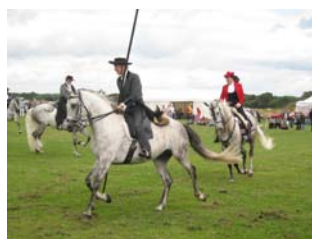
Iberian Horses with riders in national dress

present equal amounts to the Air Ambulance and Julia's House at the Lions Charter Anniversary Dinner on 8 November.