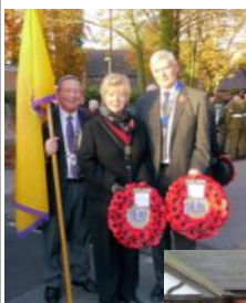
With Hart and Fleet Presidents

service and parade. It started at our own church where we went to the cenotaph via the internet. Lunch was in the Pub with other members from the club. Off we went to the parish church for the service and then across the road to muster in the car park with many other organisations preparing to honour the fallen. I did not take up the tickets for London preferring to be with my own club this year. The march through town was very moving as the streets were lined with many people. It ended with a few words and the laying of wreaths at the town war memorial. Then coffee and hot chocolate in a local coffee shop with family and friends.