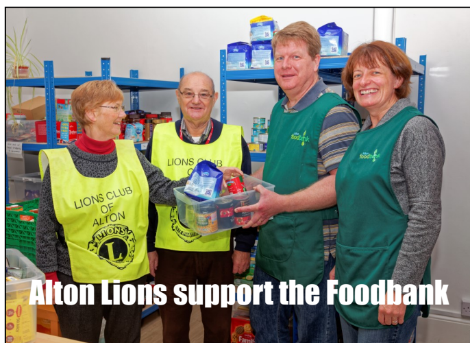
Alton Lions support the Foodbank