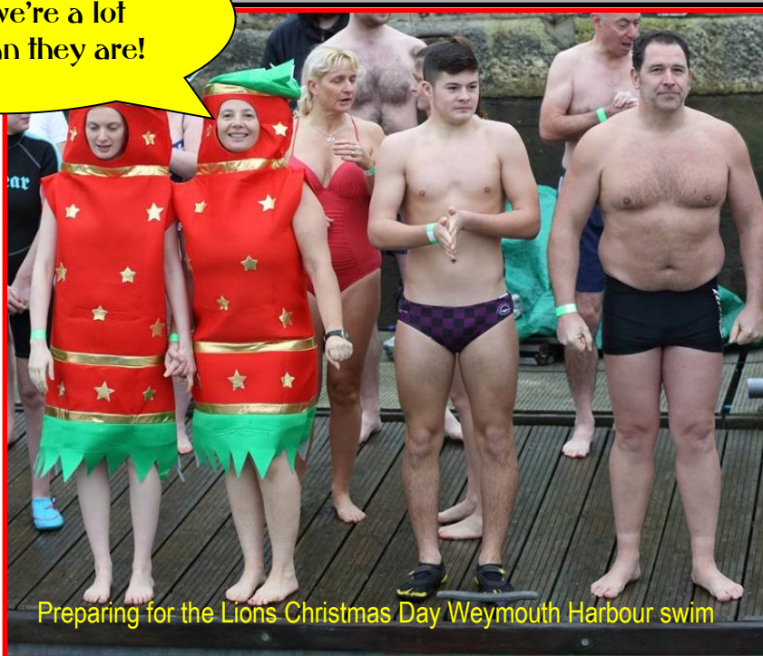
Preparing for the Lions Christmas Day Weymouth Harbour swim

Please send all articles and pictures for publication in the