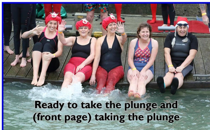
Ready to take the plunge and (front page) taking the plunge

Several thousand people lined Weymouth Harbour on Christmas Day morning to watch the annual harbour swim organised by the Weymouth & Portland Lions Club. 336 swimmers took to the water in nine separate swims raising more than £23,000 between them for a whole host of national and local charities and it is understood that there is more to come from online donation sites which are not included here. Swimmers came from far and wide including a couple from Germany and a lady from Abu Dhabi.