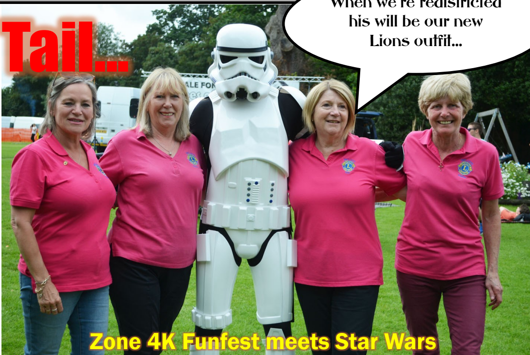
Zone 4K Funfest meets Star Wars

Please send all articles and pictures for publication in the