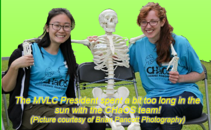
The MVLC President spent a bit too long in the sun with the CHaOS team!

Although we are still reconciling our accounts, it looks like we will clear well in excess of £4,500 for our charity account as a result of income from all the fete's activities, which is a great result for a small village event. We've had some very positive feedback and received fantastic support from dozens of Lions friends and supporters who helped.