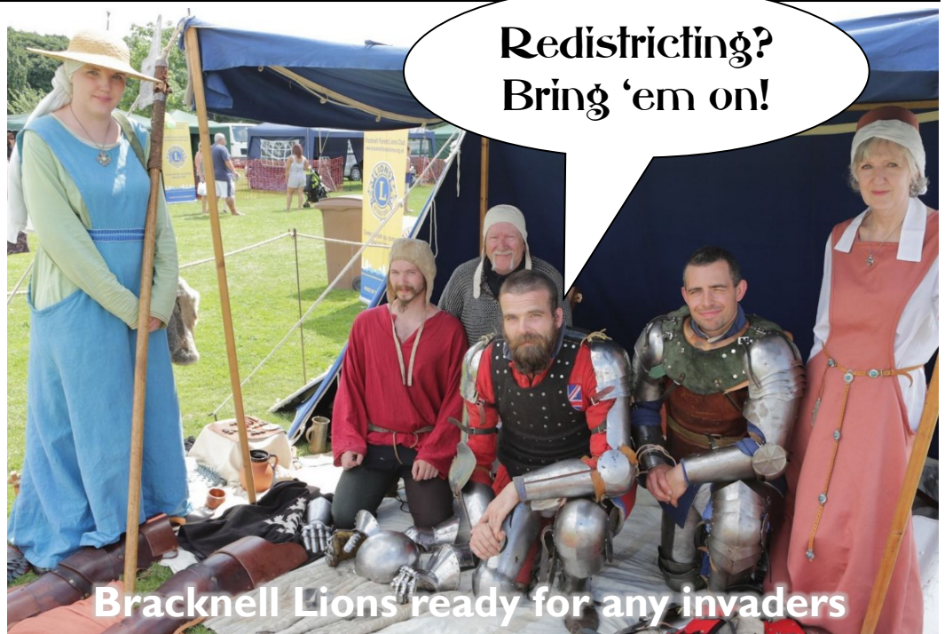
Bracknell Lions ready for any invaders

Please send all articles and pictures for publication in the