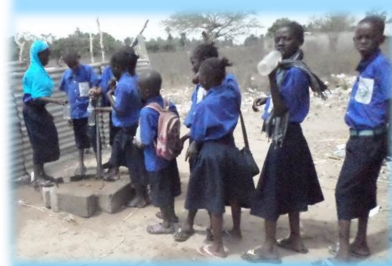
Villagers queuing for water at one of the very few taps