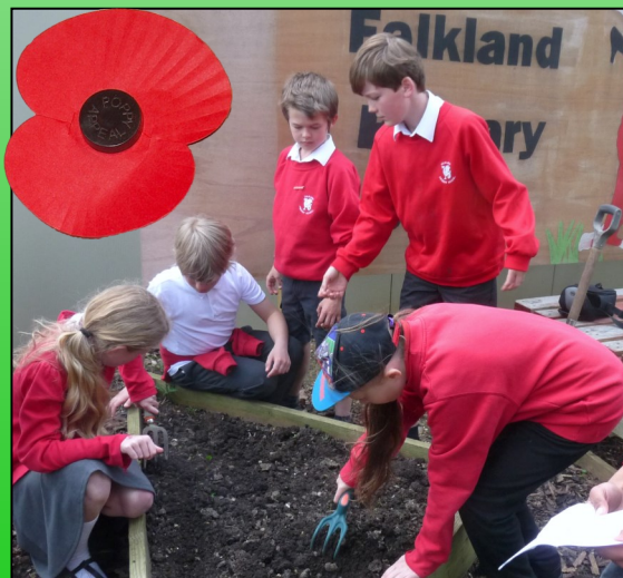
Youngsters sowing poppy seeds at the Falkland Memorial

The Lions Club of Newbury has been working closely with Newbury Town Council and its plans to commemorate World War I. In addition to other events, including a vigil at the Town's War Memorial in honour of the fallen at the Somme which also involved some of the Lions, the Town Council proposed sowing poppy seeds at various locations within its boundaries. The Lions purchased the seeds, along with sand to assist with the sowing, and offered to be involved with the sowing as well. The locations included primary schools and areas representing the Town's history during major conflicts. When visiting the schools, Lions explained the significance of the poppy and the process involved to ensure succession planting takes place and provide an even greater show of remembrance. Not only has this worthwhile experience added to the Club's involvement with the Heritage element of the Centennial Celebrations it has cemented our links with local Schools and the Town Council.