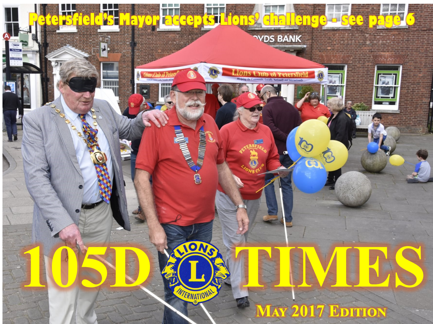
Petersfield's Mayor accepts Lions' challenge - see page 6

105D LIONS INTERNATIONAL TIMES MAY 2017 EDITION