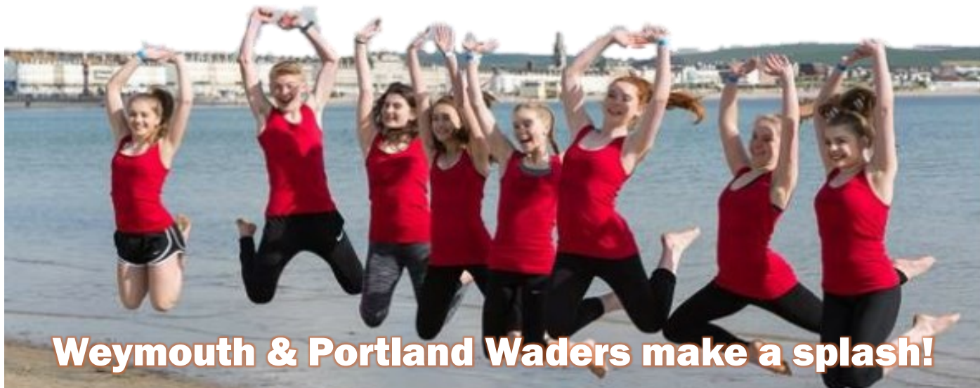
Weymouth & Portland Waders make a splash!