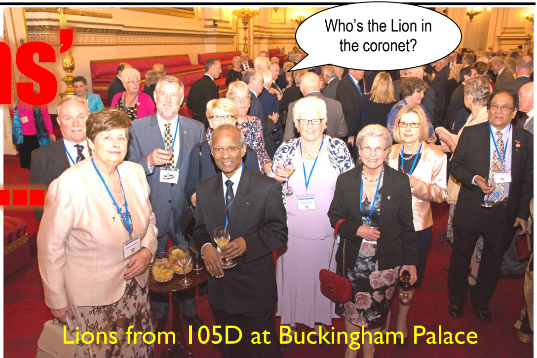
Lions from 105D at Buckingham Palace

Please send all articles and pictures for publication in the