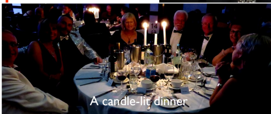
A candle-lit dinner