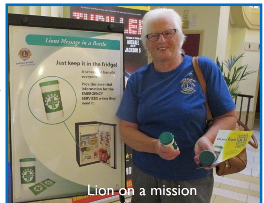
Lion on a mission

Perhaps all Lions should look out for any opportunity to promote Lions Clubs International since this can occur in the most unexpected ways and places!