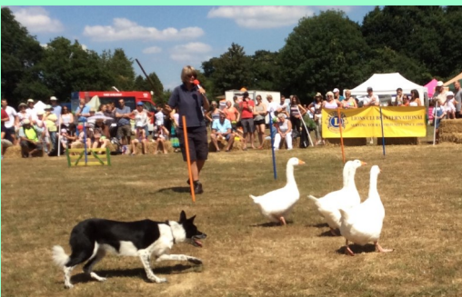
Flight, the sheepdog tries his paw at herding geese at the Hook Village Show!

Local MP Ranil Jayawardena, who had grown up in Hook, opened the event. The arena events highlighted various entertainments and there were around 100 entries from classic vehicles to fairground rides, donkeys to doughnut stalls, a food court, face painting and fairy land stalls plus many charity and commercial stalls. In addition, in the Community Hall, there was a Craft and Produce Fair which also attracted visitors.