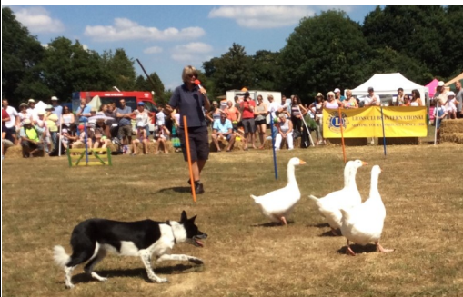
Flight, the sheepdog tries his paw at herding geese at the Hook Village Show!

Local MP Ranil Jayawardena, who had grown up in Hook, opened the event. The arena events highlighted various entertainments and there were around 100 entries from classic vehicles to fairground rides, donkeys to doughnut stalls, a food court, face painting and fairy land stalls plus many charity and commercial stalls. In addition, in the Community Hall, there was a Craft and Produce Fair which also attracted visitors.