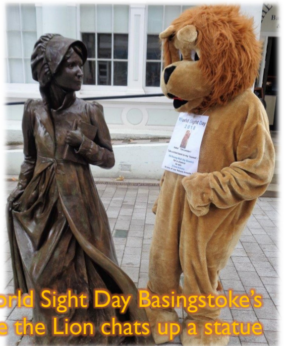
On World Sight Day Basingstoke's Lennie the Lion chats up a statue

Please send all articles and pictures for publication in the