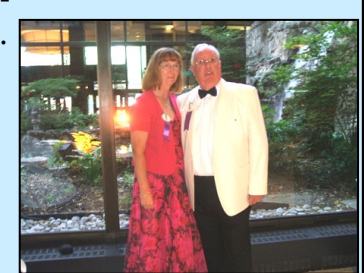
All dressed up with somewhere to go

Then into the three days of the Convention proper culminating for the first time in a contested election for 2<sup>nd</sup> Vice President which caused the